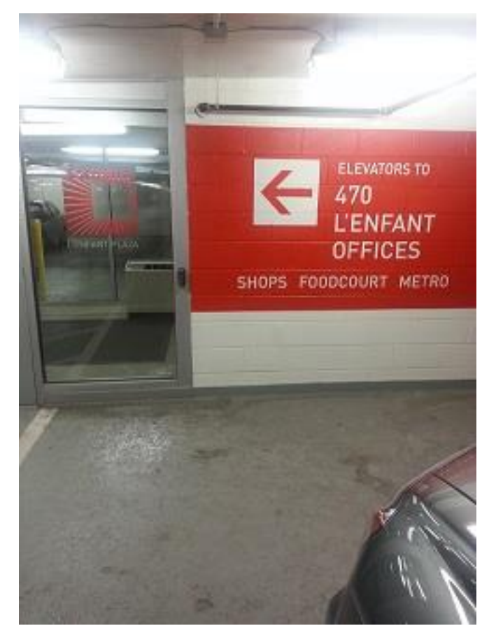
Elevator entrance for garage level (G2)