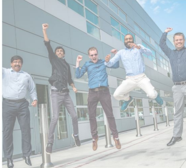
EMPLOYEE RESOURCE GROUPS