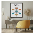
Operations Org Chart