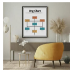
Operations Org Chart