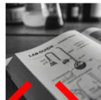
Resources and How To